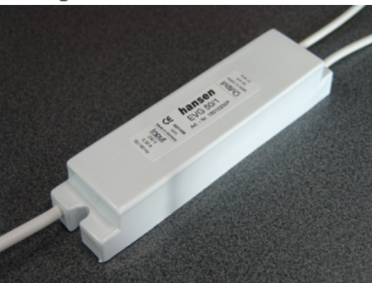
Housing colour: white Dimensions: 160 x 40 x 27 mm Packaging case: 2